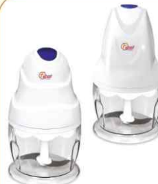
SF 604 250W