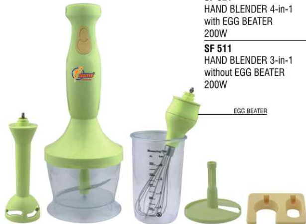
SF 521 HAND BLENDER 4-in-1 with EGG BEATER 200W