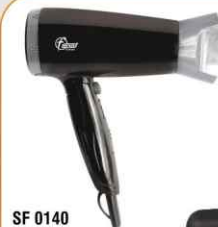
SF 0140 Hair Dryer with foldable handle 1000W