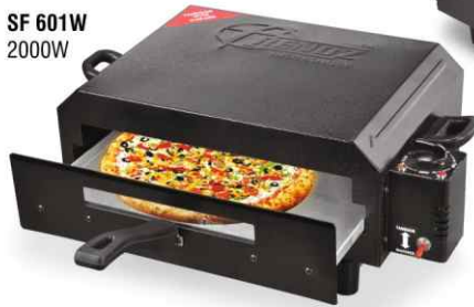
SF 601W 2000W