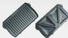
SF 065 Multi Grill SANDWICH TOASTER 2 in 1 750W

Available in two plates sandwich or grill