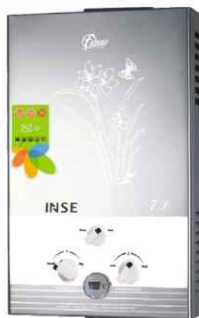
SF 640 Gas Water Heater INSE 7 Lts.