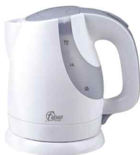
SF 651 Electric Kettle L.E.D. 1.7 Lts./1850W