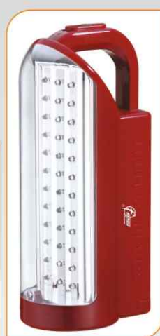
SF 596 Rechargeable Lantern LED Led: 36 Pcs. Duration: 55 Hrs./12 Led* 28 Hrs./36 Led*