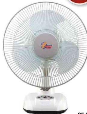
CF 676 12" Rechargeable Fan 24W with 2 LED Night Light