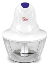
JUMBO MAGIC CHOPPER