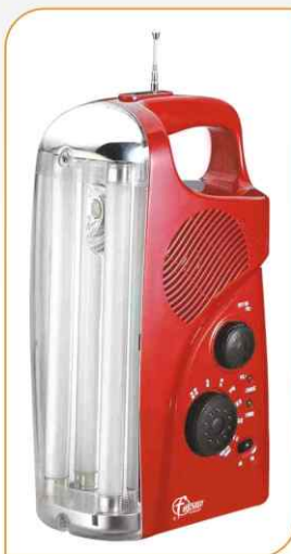
GF 908 Rechargeable Lantern with FM Tube: 6 Watts Duration: 7.5 Hrs./Tube* 08 Hrs./Torch*