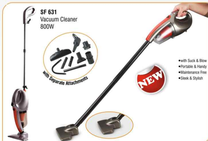
SF 631 Vacuum Cleaner 800W