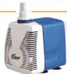
SF 671 2.5M Big