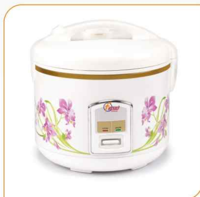
SF 525/575 Rice cooker 1.8L~2.8L