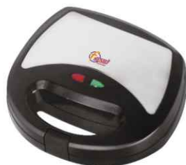
• 2 slice sandwich maker