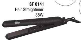
SF 0141 Hair Straightener 35W