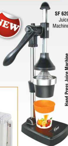
SF 620 Juice Machine