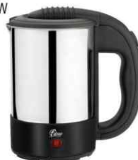
SF 006 Electric Kettle 1.Lts./1350W