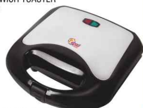
• 2 slice sandwich maker