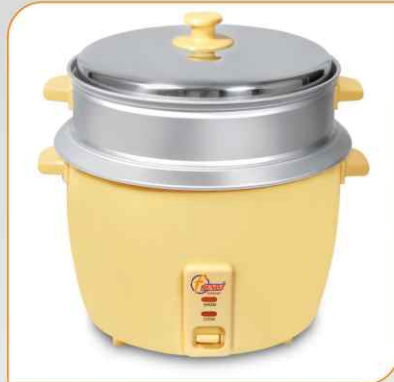
SF 935/945 Rice cooker 1.8L~2.8L