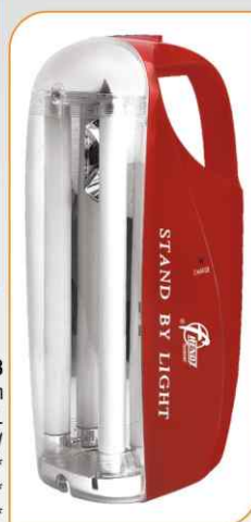
SF 508 Rechargeable Lantern Tube: 2 x 6 W PL Bulb: 1 x 6 W Duration: 7.5 Hrs./1 Tube* 3.5 Hrs./2 Tube * 8.5 Hrs./ Bulb *