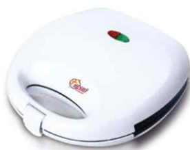
• 2 slice sandwich maker

Available in two plates sandwich or grill