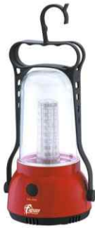
SF 0115 Rechargeable Lantern LED Led: 24 Pcs. Duration: 24 Hrs.*