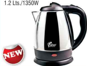
SF 672 Electric Kettle 1.2 Lts./1350W