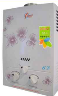
SF 629 Gas Water Heater 6 Lts.