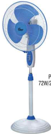
GF 1114 Pedestal Fan 72W/2000 R.P.M. 16"