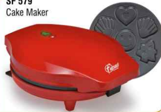
SF 579 Cake Maker