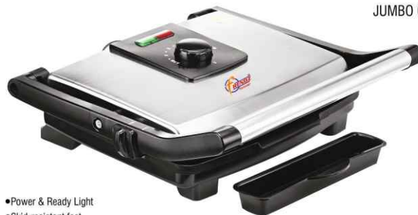
SF 584 JUMBO GRILLER 2000W