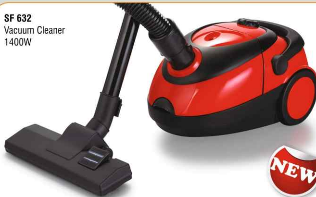
SF 632 Vacuum Cleaner 1400W