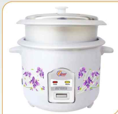
GF 925/975 Rice cooker 1.8L~2.8L