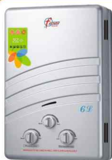
SF 680 Gas Water Heater 6 Lts.