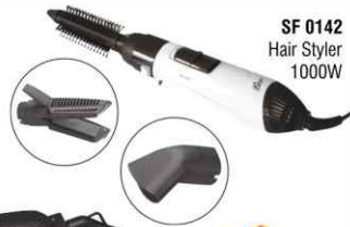
SF 0142 Hair Styler 1000W