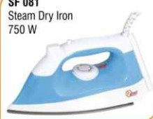
SF 081 Steam Dry Iron 750 W