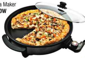
SF 033 Pizza Maker 2000W