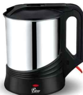
SF 007 Electric Kettle 1.7 Lts./1850W