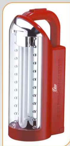
SF 922/522 Rechargeable Lantern LED Led: 24 Pcs. Tube: 1 x 11 W PL Duration: 24 Hrs./LED* 4.5 Hrs./Tube*