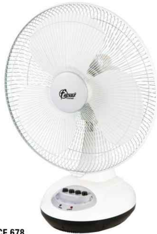
CF 678 16" Rechargeable Fan 30W Duration: 6 Hrs*

* Duration time are under tested conditions.