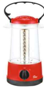
SF 0171 Rechargeable Lantern LED Led: 32 Pcs. Duration: Approx. 3.5 Hrs.*