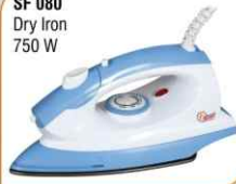
SF 080 Dry Iron 750 W