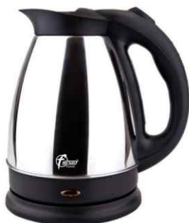
SF 951 Electric Kettle 1.7 Lts./1500W