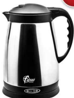
SF 673 Electric Kettle 1.8 Lts./1000W