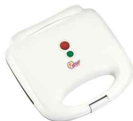
• 2 slice sandwich maker