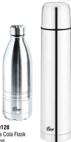
SF 0128 Coca Cola Flask 500ml