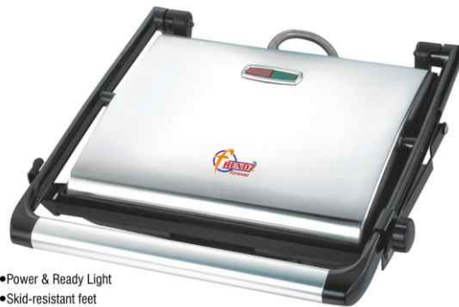
SF 684 JUMBO GRILLER 2000W