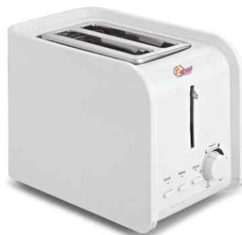
SF 017 POP-UP TOASTER 750W