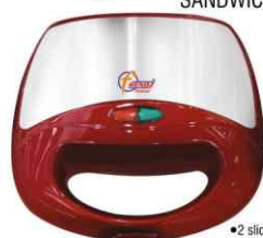
SF 664 SANDWICH TOASTER 750W